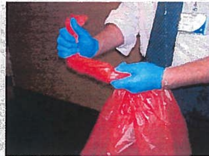
Twist the top