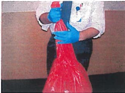
Always wear gloves