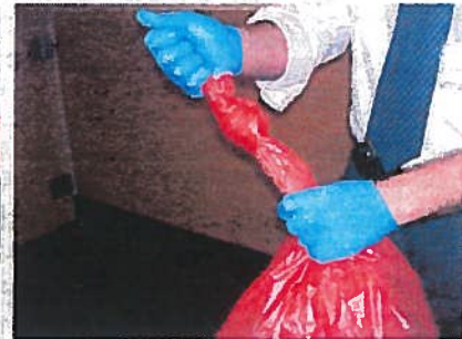
Tie a knot