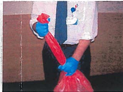
Bag shouldn't be more than \frac{1}{2} full