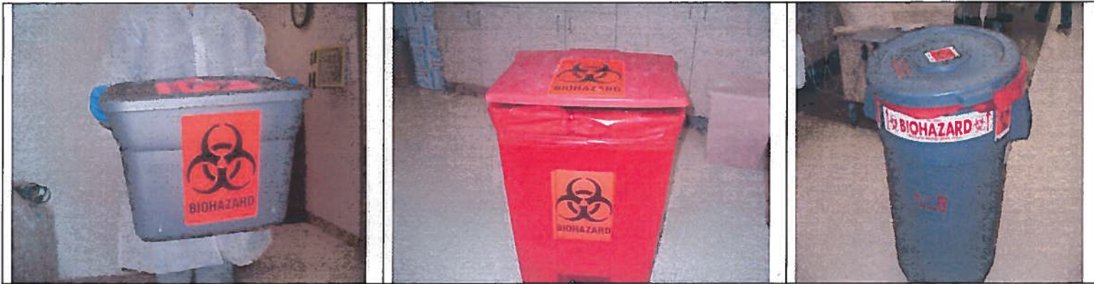
Always transport in a rigid container with a tight-fitting lid