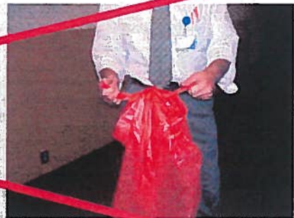
A butterfly knot leaves more of a chance of leakage

Reference: California Health and Safety Code (HSC) Section 118280(a)